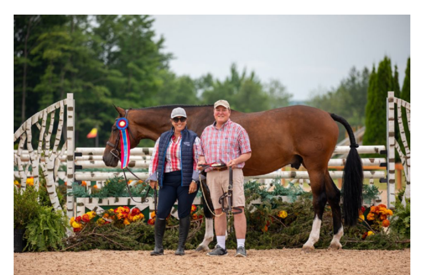
Durpetti Equestrian LLC's Cassius was presented as the High Performance Hunter champion during GLEF III.

week in Traverse City, MI, <u>you can find it</u> <u>online here</u>, and now, enjoy our photo recap of GLEF III and GLEF IV here!